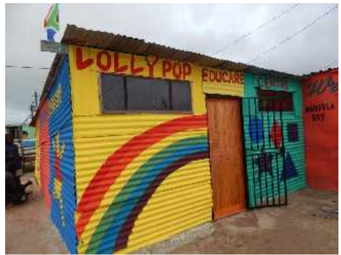
ECD makeover activities in partnership with JAM were very inspiring.