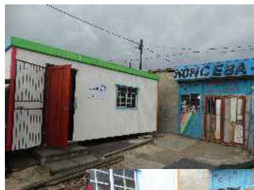
Breadline Africa participated in a preschool makeover for Nonceba Crèche