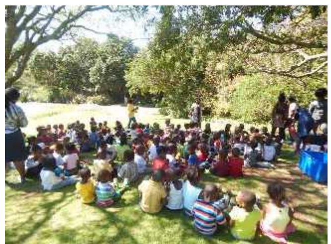
A colourful and exciting and informative Kirstenbosch gardens outing for the children brought smiles and excitement to the little ones