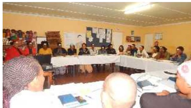
Inclusive Education Training