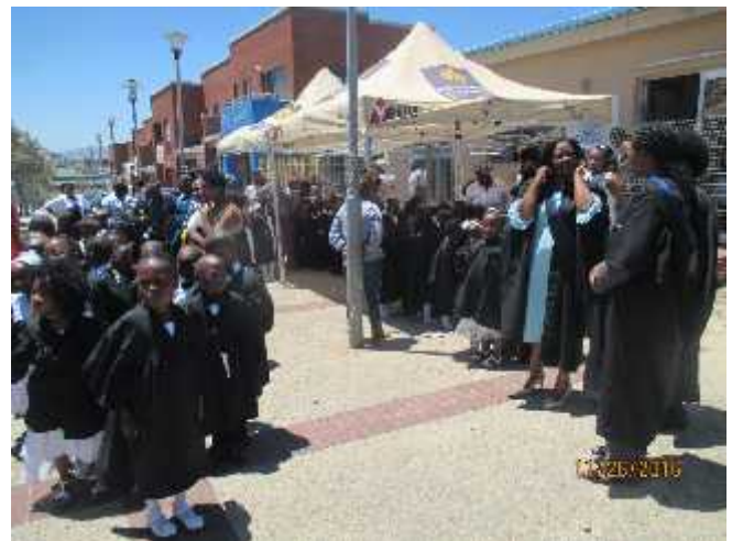
144 children from Sikhula Sonke out of centre programme and 77 children from the ECD centres graduated in a colourful exciting and massive annual joint ECD graduation on 25 November 2016.