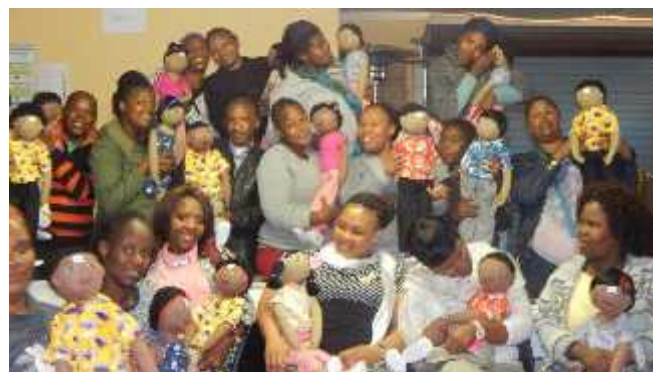
Persona Doll Training

Unlimited Child Training: various team members.