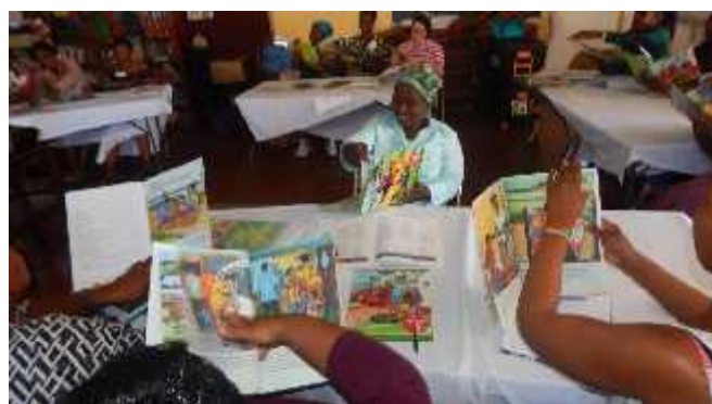
Unlimited Child Training