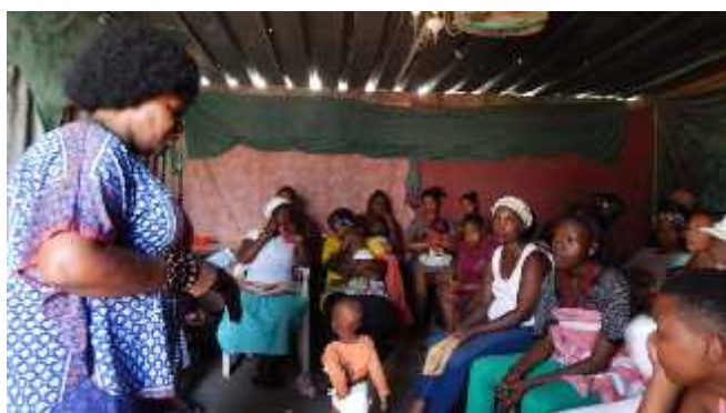
Working with FCM caregivers

The psychosocial team dealt with 464 families in the last financial year; the table to the right describes cases which were successfully accomplished.