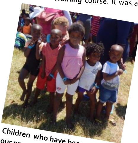
Children who have been part of our programmes this year: "Look cool! There's a camera!"