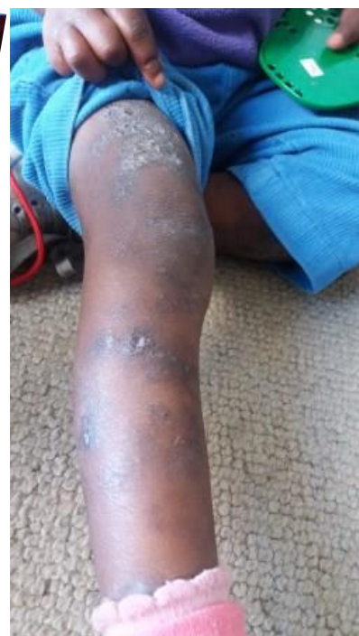
Khayelitsha medical staff and the Sikhula Sonke teams treated a skin rash outbreak in children in an Emthonjeni programme. The swift intervention saw quick healing and smiling faces again.