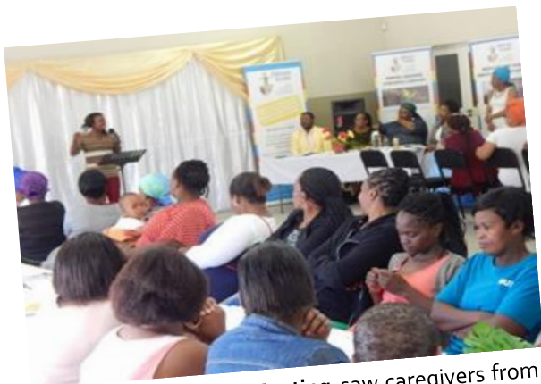
The Annual General Meeting saw caregivers from different sections attending. They testified of the changes that happened in their children's lives.