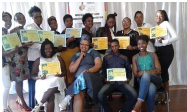
18 Sikhula Sonke staff completed the FCM training. This is the first group of FCM graduates trained by the organization itself.