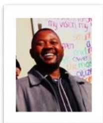
Abantwana baseKhayelitsha babamba ngazo zozibini, Maz' enethole.

Thank you to all of our partners for your path in this organisation. A special thank you to the Khayelitsha Development Forum for the Community Works Program volunteers who volunteered to cook for young children in our programs. Thank you to all of our funders for making this quarter a success; your investment and confidence in our team and our programs has taken us further and further.