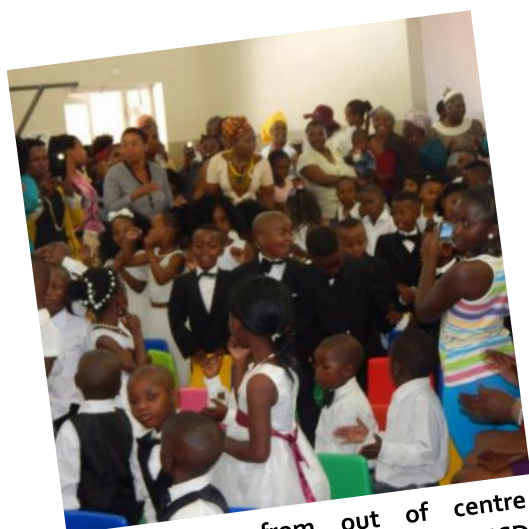
144 children from out of centre programmes and 77 children from ECD centres graduated at the 2016 joint ECD Graduation