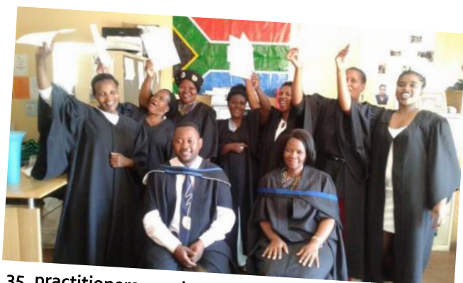
35 practitioners graduated from our Basic Teacher Training course. It was a time of harvest after sowing