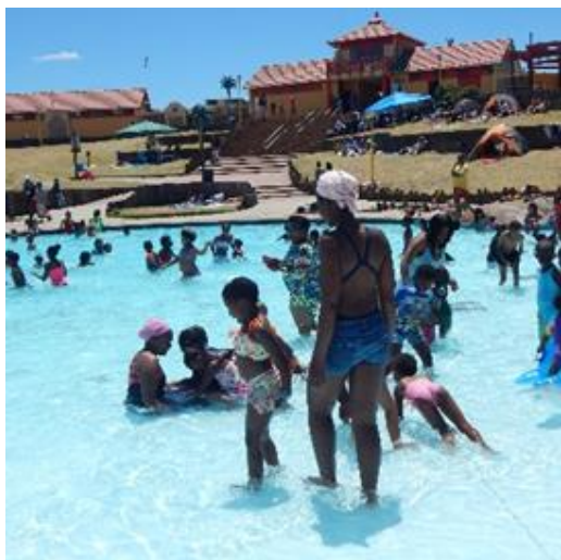
Children enjoyed their exciting and playful end-of-year outing at Mnandi Beach . They received shorts and shirts sponsored by Joint Aid Management.