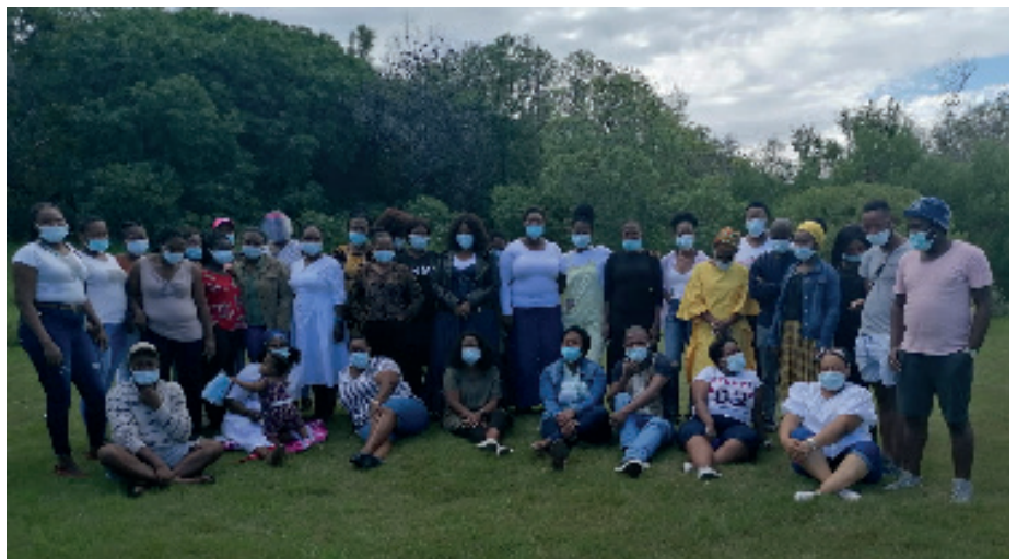
The 2021 Sikhula Sonke ECD Team

We continue to push literacy at home: our thanks to BookDash for continuing to provide lovely books in Xhosa so that families can read together and bond with their children.