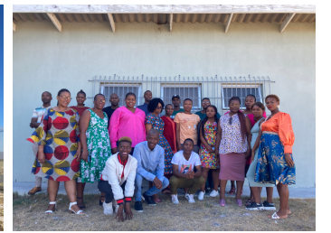
Above (clockwise from top left): Toy Library team, FCM team, Fatherhood Network team, Emthonjeni team