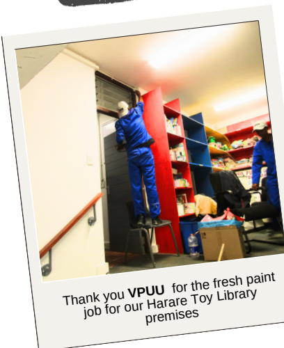
Thank you VPUU for the fresh paint job for our Harare Toy Library premises