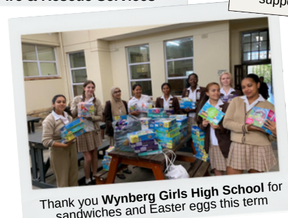
Thank you Wynberg Girls High School for sandwiches and Easter eggs this term