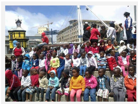
A wonderful experience for both children and staff

Many thanks to FCM and Emthonjeni fieldworkers who organised this learning excursion. We'd also like to thank the caregivers for trusting our staff members with their own children.