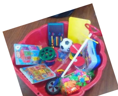
Toy packs donated by FNB